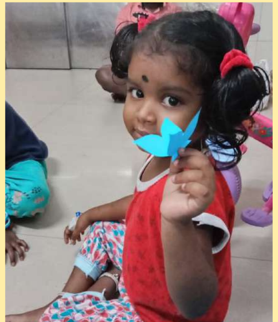
Play Therapy @ Baby Hospital