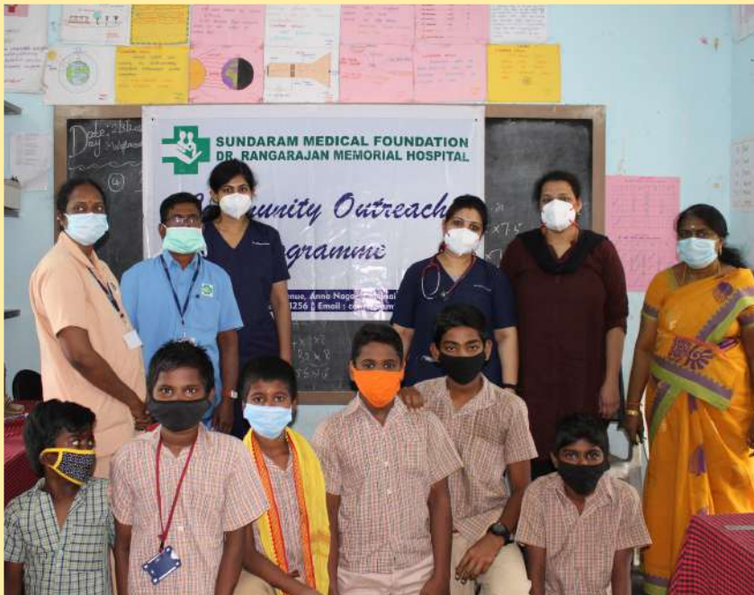
Medical Camp @ SAP School